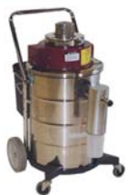
MRS 1 - for liquid mercury recovery (Includes Separator)