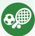
Sports and More