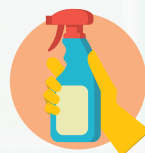
Any Handheld Trigger Sprayer Bottle