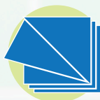
Make Your Own Wipes