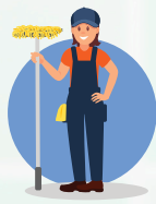
Micro-fiber Mop System