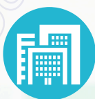
Building Service Cleaners