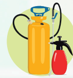
Any Coarse Trigger Sprayer