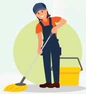
Standard Mop Bucket