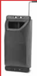
4-Gallon Tank Available in 9 Different Colors

Optional splash guard available in all sizes.