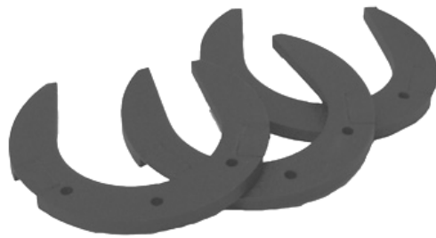
A0032-1P -- Optional 25# Horseshoe Weights (each) A0032-3P -- Optional 36# Horseshoe Weights (each)