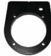
A0032-2P 20# Frame Weight