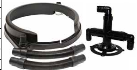
Dust Pick-Up System For a BRUTE Machine