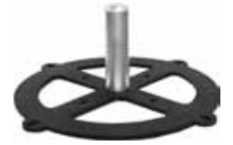
HP0008-3INBRUTE Motor Mounted Weight Post Kit