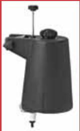
2-Gallon Tank (Available in 3 Different Colors)